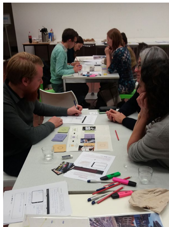
Co-design workshop with Ghentians and regular visitors

Overall, the research revealed some rich insights that will be available in the soon to be published deliverable.