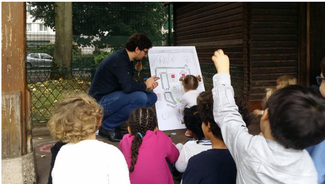
OASIS, Paris (FR)