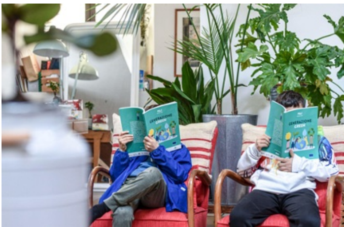
The "Green Generation" toolkit developed by Legambiente

Legambiente, instead, sowed a new environmental culture capable of understanding the importance of greenery in our cities. Accordingly, Legambiente delivered urban walks, seminars, talks, courses and toolkits all aiming to underline the importance of trees and biodiversity in our urban environment. In addition to that, the main actions of Legambiente took place in schools. Ad-hoc educational activities and materials were prepared and made available to students and teachers. By doing this, the Municipality of Prato is investing in education, training and vocational training for skills and lifelong learning in order to form a new responsible and sustainable generation of citizens.