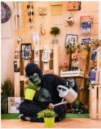
greenApes has created a specific section for the Municipality of Prato @ City of Prato