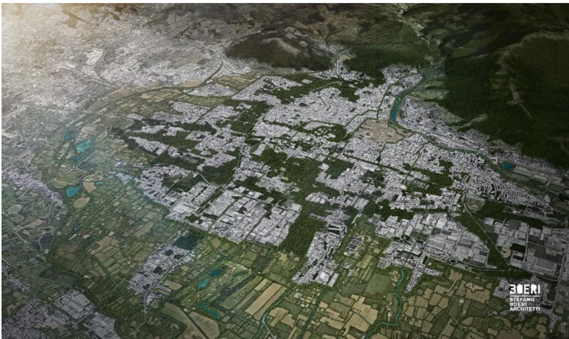
Illustration of the Master Plan for the Municipality of Prato developed by Boeri Architects in 2018

The Prato Urban Jungle was selected as a case study because of its adoption of a community-led approach to designing, developing and maintaining the Urban Jungles.