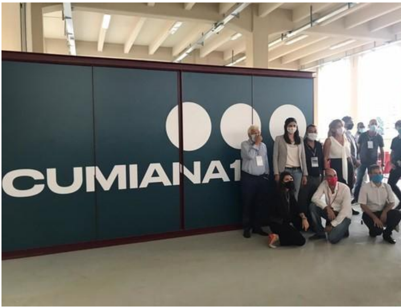
Figure 1 Inaugural reception of CUMIANA15, September 2020.

[1] See http://www.retecasesdelquartiere.org/ . See also Tiziana Caponio and Davide Donatiello, Intercultural policy in times of crisis: theory and practice in the case of Turin, Italy , Comparative Migration Studies , 2017.