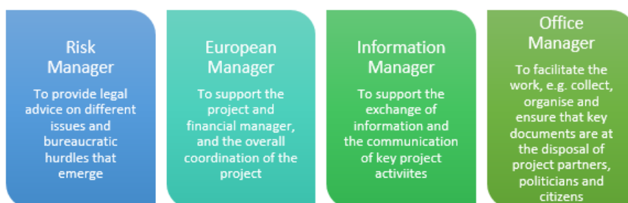
The City of Portici external AIR-HERITAGE experts

Hence, the City of Portici has built an effective implementation team and is more efficiently managing and coordinating AIR-HERITAGE. The experience gained will also help the City in managing other future complex projects and activities.