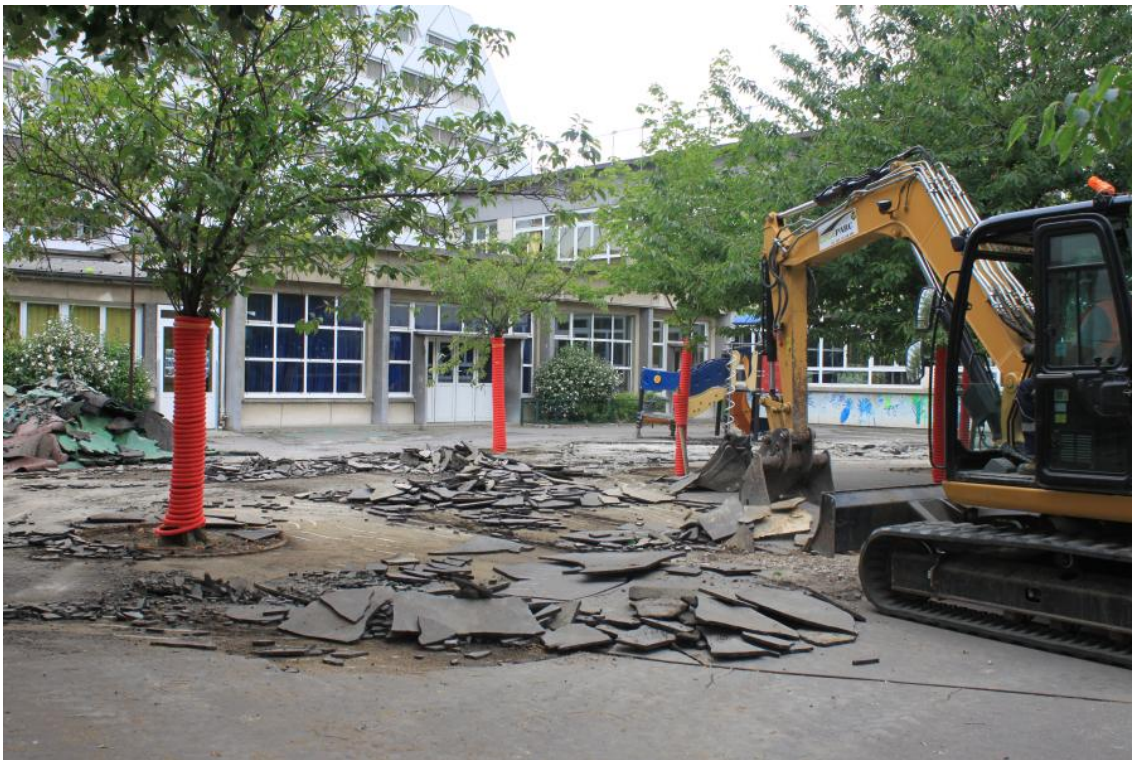
Transformation Work Maryse Hilsz School

Review of the OASIS evaluation experience suggests that projects implemented within institutions (such as schools, in the case of OASIS) could benefit from approaching the establishments as systems, built out of various elements and groups. In this regard, OASIS evaluation focused first and foremost on how the intervention affected the pupils during the scope of their breaks between classes, specifically. A system approach to school could reveal interesting findings about how other school members (such as teachers and other staff) can also be impacted by transformed and friendlier school yards. Equally interesting could be the exploration of possible changes in pupils' behaviour outside of the time spent directly in the school yards (during classes, for instance). Generally speaking, projects similar to OASIS in terms of their location within institutions should consider various elements of the systems in which they operate.