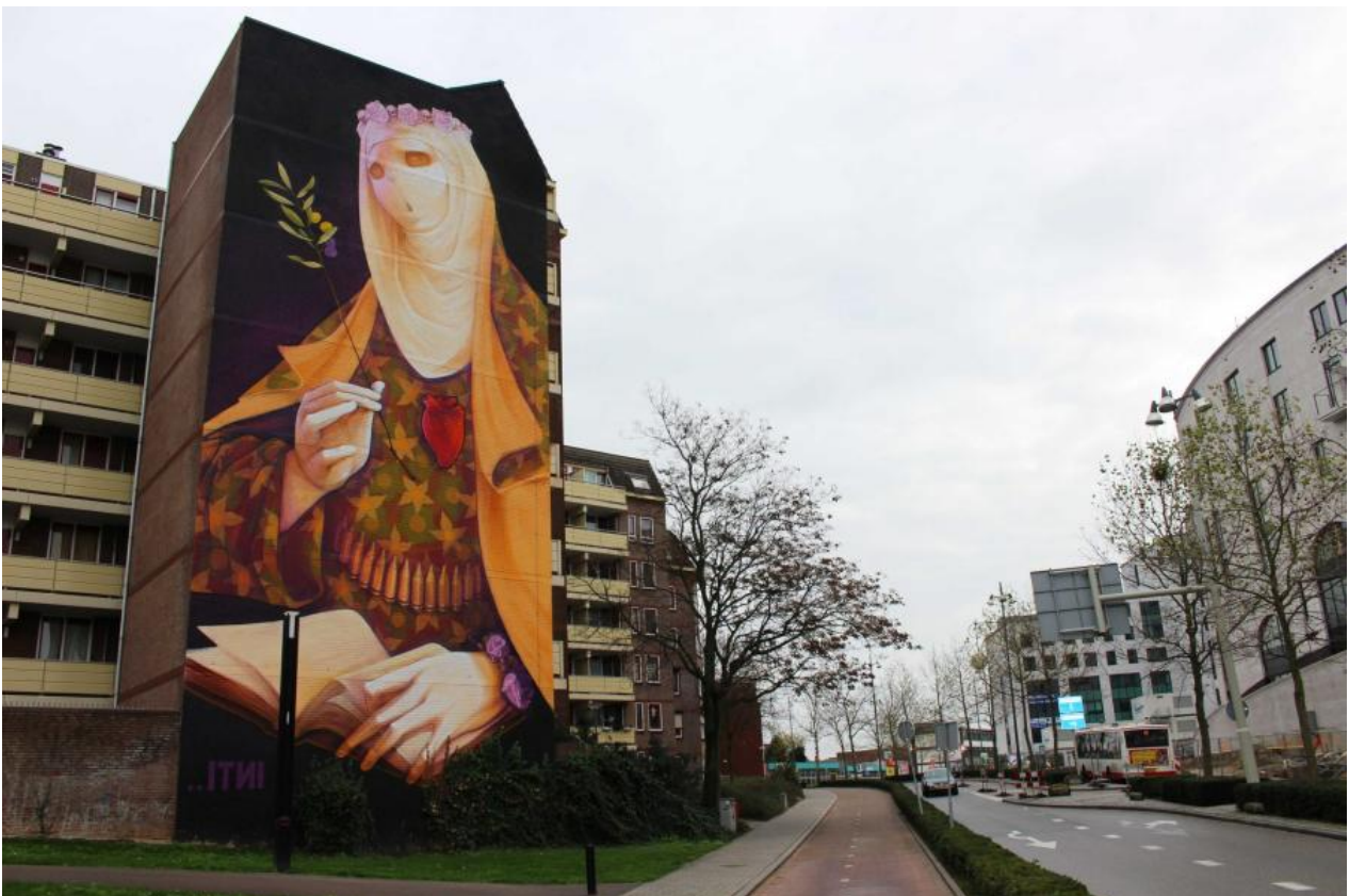
Mural next to the Maankwartier

From the turn of the century on, Heerlen managed to find its way back up again. The city slowly became a non-confirmative and raw-edged cultural hotbed, filled with murals, street art and the like. Its edgy feel contrasts its southern Limburg counterpart, the historically attractive Maastricht. Recently, Heerlen's train station area was transformed into the Maankwartier (Moon Quarter), a major and prestigious urban development project of 90,000 square metres that resembles Florence's Ponte Vecchio. The Province of Limburg has designated the Heerlen region – Parkstad Limburg – a recreative zone, creating multiple attraction alongside its Pinkpop event area. Hosting a zoo, botanical gardens and the world's second biggest indoor ski-facility (35,000 square metres) on the artificial slopes of its former State Mine Wilhelmina.