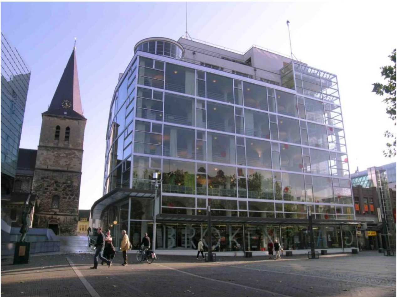
Glaspaleis department store

After the decline of coalmining in the 1950s, Heerlen's gained prosperity vanishes just as suddenly. Ironically, Heerlen took this momentum – decades before the recognition of the beauty of industrial heritage – to redevelop and plan the city for a new age. Demolishing most of its mining heritage in the 1960s, in order to raise then-modern apartment blocks. Even more ironic, the instability of the mining underground, forced demolition of some of the apartment complexes a few decades later.