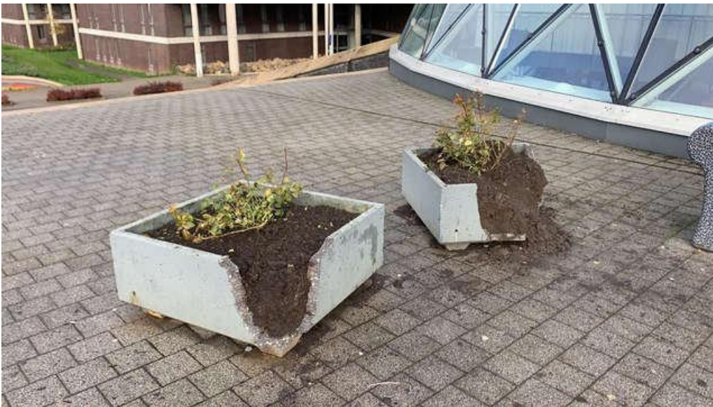
Flower boxes vandalised at Corneliusplein

The first challenge is the rising cost for the maintenance of the public space. The demolition of housing has led to an increase of public area within the city, while its maintenance budget did not grow accordingly. Since the latter is defined by the number of inhabitants of a municipality. Therefore, the municipality can no longer offer its desired level of cleanliness of public facilities or counter vandalism in the public space adequately. According to surveys among citizens, the ratings for their living environment are dropping and an increasing number find the public spaces unpleasant.