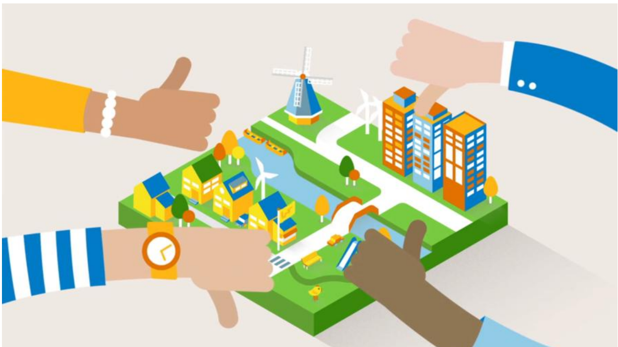
Dutch Environment and Planning Act

During the last decades, the Dutch welfare state has been gradually wound down, mostly because of its right-wing liberal orientation. This has led to policy based on self-reliance and the notion of the importance of civic participation in decision-making. The first coming mainly into effect in social policy and the Social Support Law (2015), that has been decentralising the execution from the national government to the municipalities. The latter in spatial policy and urban planning via the Environment and Planning Act (2016). Fuelled by the belief that civic engagement and participation early on in spatial decision-making will dwindle the number of costly and lengthy complaining procedures. Being a densely populated country, the Netherlands has a history of civic activism and Nimbys (not-in-my-backyard protests), who have managed to stall or postpone spatial plans indefinitely.