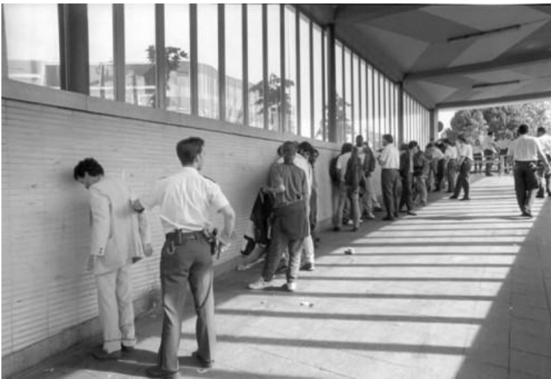
Drug tourists halted by the police in the 1980s